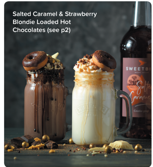
Salted Caramel & Strawberry Blondie Loaded Hot Chocolates (see p2)