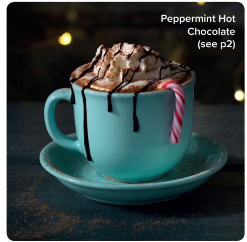
Peppermint Hot Chocolate (see p2)